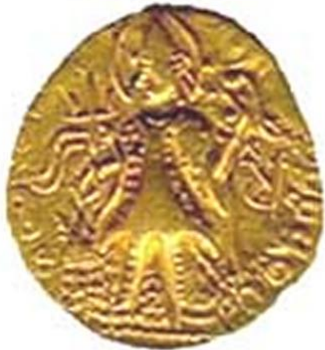
Coins of the Kushans COLLECTED BY SURESH