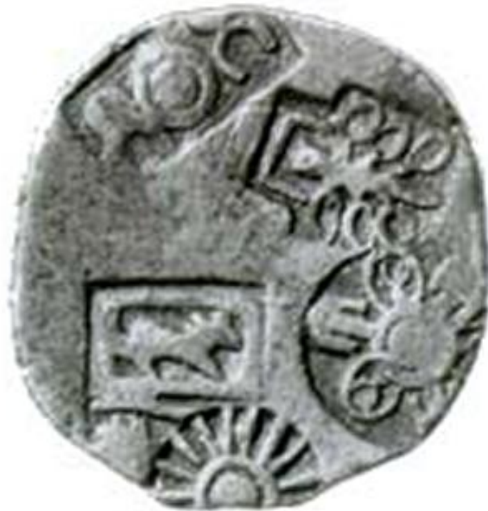
Imperial, 4th Series