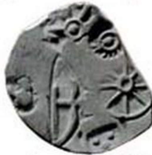
Imperial, 1st Series