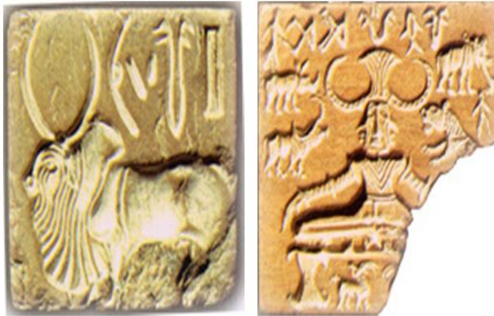
Seals of Mohenjo-Daro

The Indus valley civilisation of Mohenjo-Daro and Harappa dates back between 2500 BC and 1750 BC. There, however, is no consensus on whether the seals excavated from the sites were in fact coins.