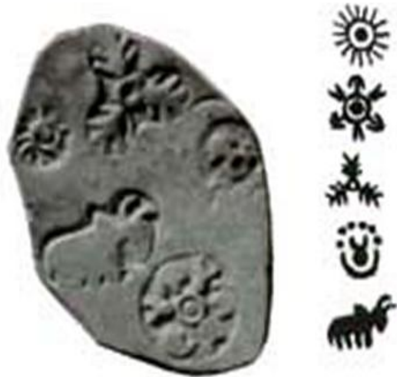
Imperial, 1st Series