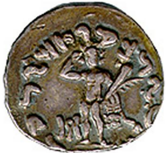
Indo-Greek Coins COLLECTED BY SURESH