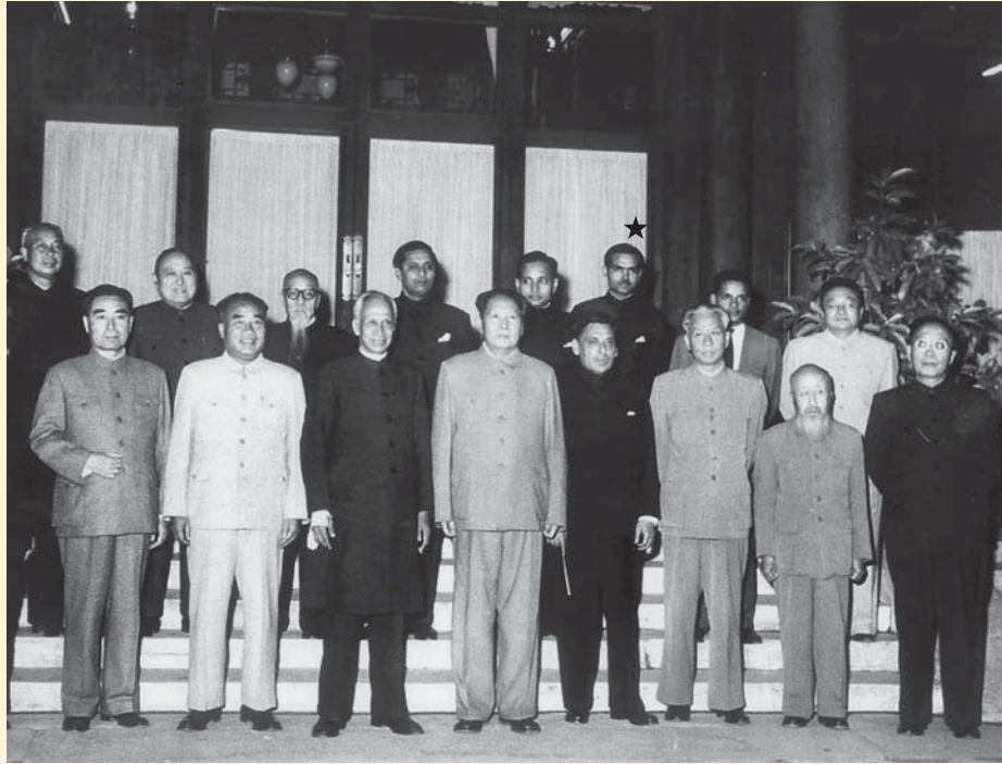
(From left to right) Premier Zhou Enlai, Zhu De, Vice President Dr. S. Radhakrishnan, Chairman Mao Zedong, Amb. R.K. Nehru, Liu Shaoqi, Li Jishen and Guo Moruo, China 1957

Two months later, during the visit of Premier Zhou Enlai to India, he and Prime Minister Jawaharlal Nehru issued a Joint Statement on June 28, 1954 that elaborated their vision of Panchsheel as the framework, not only for relations between the two countries, but also for their relations with all other countries, so that a solid foundation could be laid for peace and security in the world. Panchsheel , as envisioned by its creators, gave substance to the voice of newly established countries who were seeking the space to consolidate their hard won independence, as it provided an alternative ideology dedicated to peace and development of all as the basis for international interaction, whether bilateral or multilateral. At that time, the two Prime Ministers also expressed the hope in the Joint Statement that the adoption of Panchsheel “will also help in creating an area of peace which as circumstances permit can be enlarged thus lessening the chances of war and strengthening the cause of peace all over the world.”