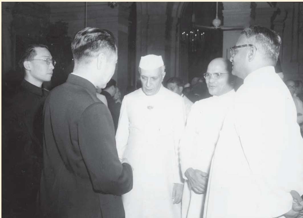
Prime Minister Jawaharlal Nehru with the Chinese Premier at the Banquet held at Rashtrapati Bhavan on June 26, 1954

(Prime Minister Rajiv Gandhi, Beijing, December 19, 1988)