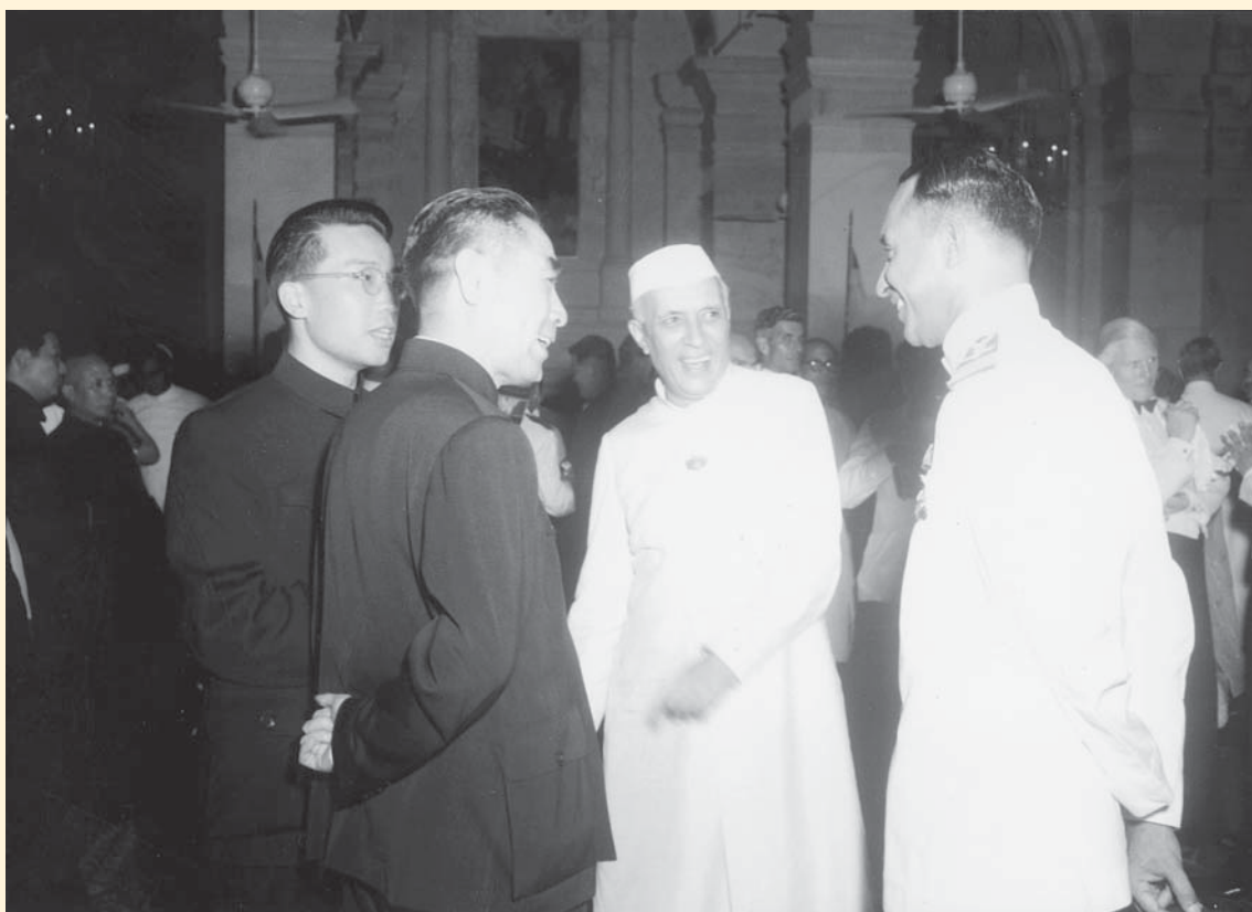
Premier Zhou Enlai at the Banquet held in his honour by Prime Minister Jawaharlal Nehru on June 27, 1954

(Joint Statement issued on June 28, 1954 during the visit of Premier Zhou Enlai of China to India)