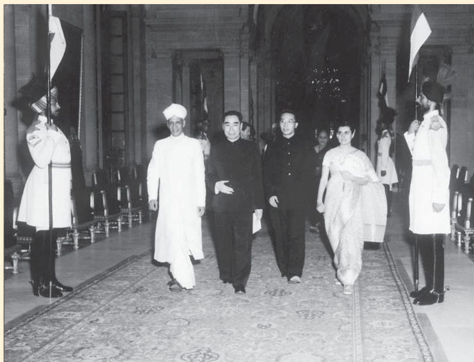
Premier Zhou Enlai arriving for the Banquet at Rashtrapati Bhavan with Dr. S. Radhakrishnan and Mrs. Indira Gandhi, June 26, 1954

Panchsheel as the principled core of the Non-Aligned Movement. Down the years, the ethos of Panchsheel continued to be reflected in world events even if there was no conscious attribution, finding expression in the position of the developing countries in the North-South dialogue, and in other groupings.