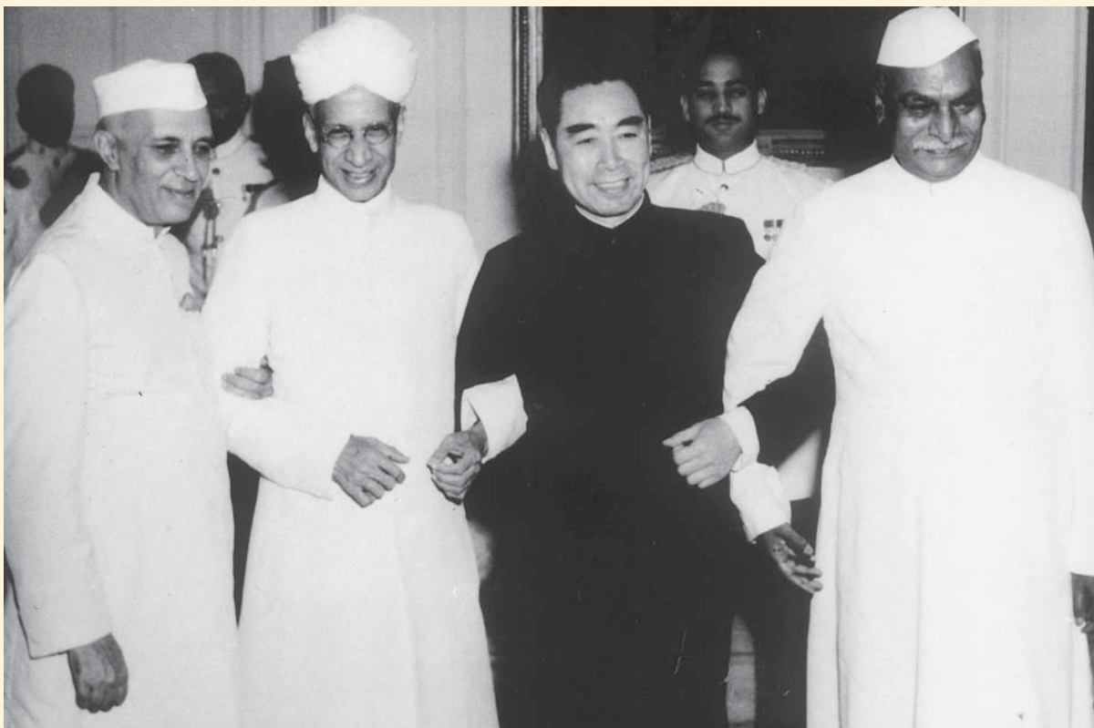
President Dr. Rajendra Prasad, Vice President Dr. S. Radhakrishnan and Prime Minister Jawaharlal Nehru with the Chinese Premier at Rashtrapati Bhavan on June 26, 1954

“The two sides emphasized that the Five Principles of mutual respect for sovereignty and territorial integrity, mutual non-aggression, non-interference in each other’s internal affairs, equality and mutual benefit, and peaceful coexistence, which were jointly initiated by India and China, which have proved full of vitality through the best of history, constitute the basic guiding principles for good relations between states. These principles also constitute the basic guidelines for the establishment of a new international political order and the New International Economic Order. Both sides agreed that their common desire was to restore, improve and develop India-China good-neighbourly and friendly relations on the basis of these principles.”