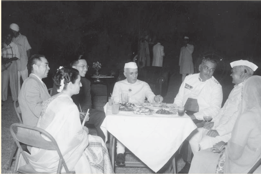
Prime Minister Jawaharlal Nehru and Premier Zhou Enlai and Mrs. Indira Gandhi at the reception in New Delhi on June 26, 1954

Panchsheel can provide the ideological foundation for this developing paradigm of international interaction, allowing all nations to work towards peace and prosperity in cooperation, while maintaining their national identity, spirit and character. Prime Minister Jawaharlal Nehru rightly said that “those who desire peace for the world must know once for all that there can be no equilibrium or stability for either the East or the West unless all aggression, all imperialist domination, all forced interference in other countries’ affairs end completely.” Today, Panchsheel can help the world move away from the traditional concepts of balance of power and competitive security, the consequent searching for an enemy, and the predicating of activities on conflicts rather than cooperation.