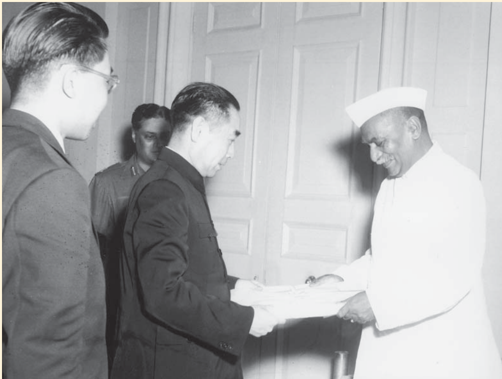
President Dr. Rajendra Prasad presenting a personal memento to Premier Zhou Enlai at Rashtrapati Bhavan on June 27, 1954

(Prime Minister Jawaharlal Nehru, speaking at banquet held in honour of Premier Zhou Enlai in New Delhi on June 26, 1954)