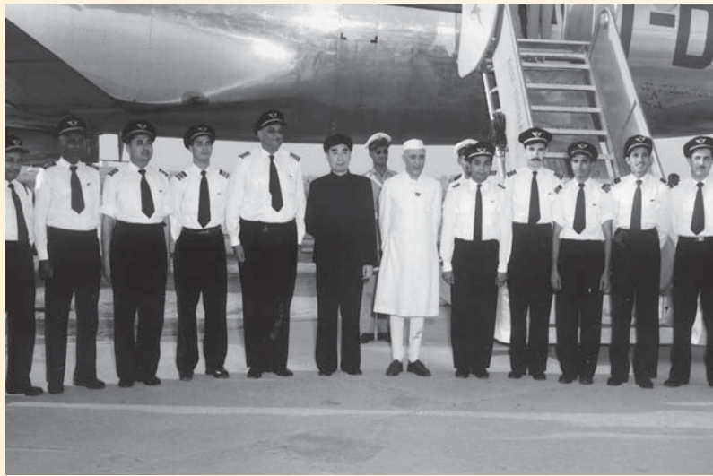
Premier Zhou Enlai seen off at New Delhi by Prime Minister Jawaharlal Nehru on June 28, 1954

(President K.R. Narayanan, Beijing University, May 30, 2000)