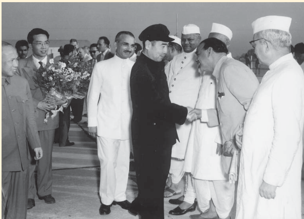
Premier Zhou Enlai bids farewell to K.M. Pannikar at New Delhi, June 28, 1954

(Prime Minister P.V. Narasimha Rao, Beijing University, September 9, 1993)