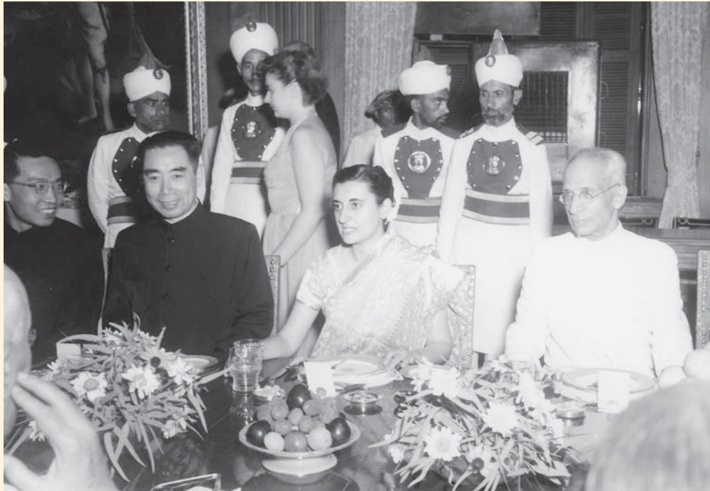
Premier Zhou Enlai at the Banquet at Rashtrapati Bhavan on June 26, 1954 with Vice President Dr. S. Radhakrishnan and Mrs. Indira Gandhi

“The two sides reaffirmed their readiness to continue to develop friendly, good neighbourly and mutually beneficial relations on the basis of the Five Principles of Peaceful Coexistence jointly initiated by India and China, for they believed that cooperation between India and China is in the fundamental and long term interests of the peoples of the two countries and is conducive to peace and stability in Asia and the world.”